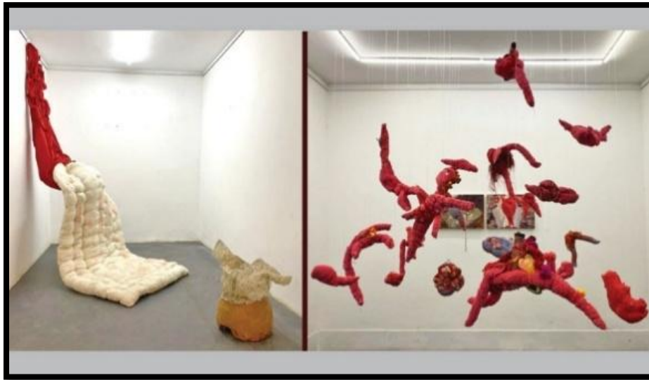
Figure 4: In/visible , Dilara Begum Jolly, Installation art, New Age

Dilara Begum Jolly's 'In/visible' depicts the female body as a reflection of male domination and violence, with visible or invisible wounds that can tell horrifying stories about the female body and the injuries it has suffered.